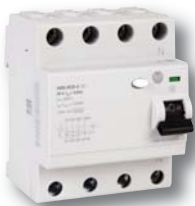
1492-RCD Residual Current Devices